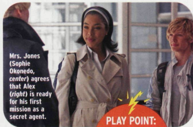
Mrs. Jones (Sophie Okonedo, center) agrees that Alex (right) is ready for his first mission as a secret agent.